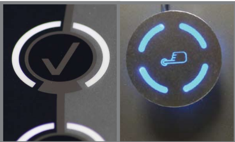
figure 1 - Illuminated Capacitive Switch Products