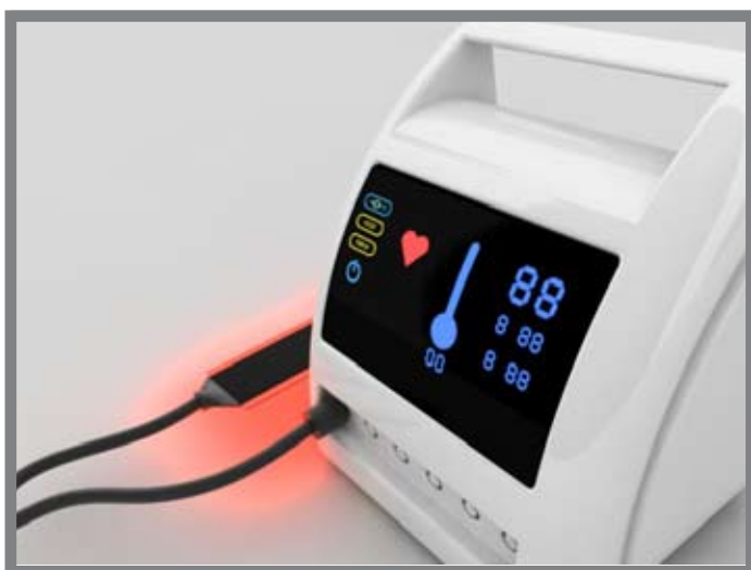
figure 3 - Medical Instrument with segmented lighting and Cap Switch

Multiple Segmented lightguides Single lightguide